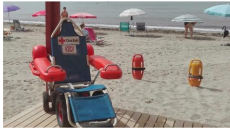
6 Silla anfibia