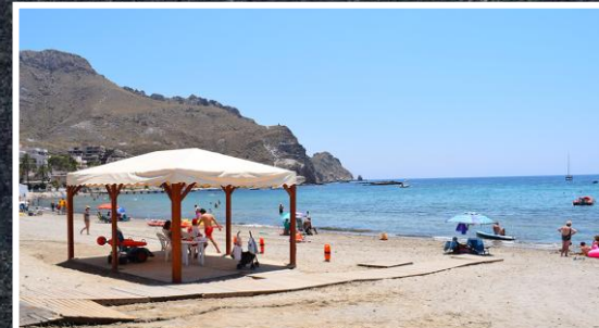
5 Vista general